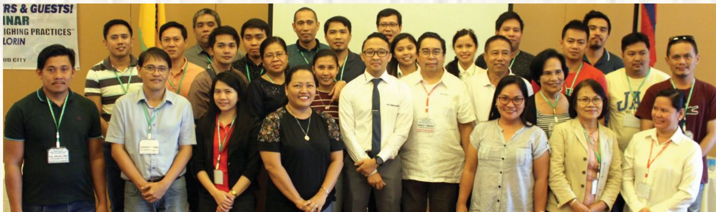
Group photo with participants from VICMICO Planters, HPCO, VMC, Option-MPC, AHSSI Planters, Lopez Sugar, Sagay Central)