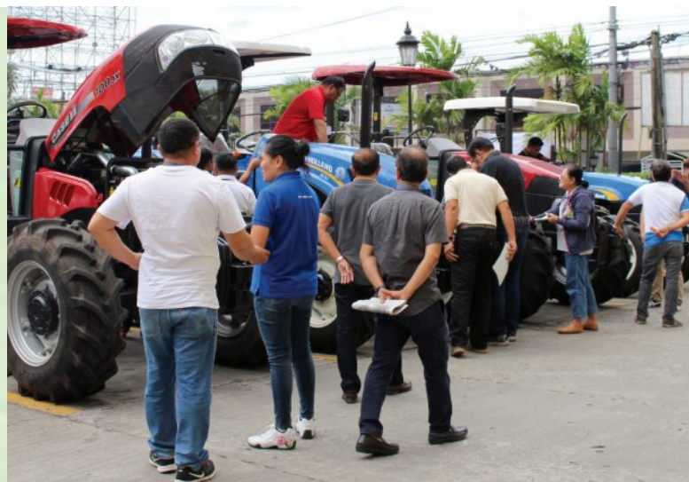
Participants inspect the farm tractors of Filholland Corporation displayed at Planta Centro Hotel, Bacolod City.