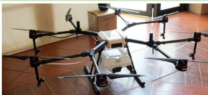
Drone which is used for fertilization