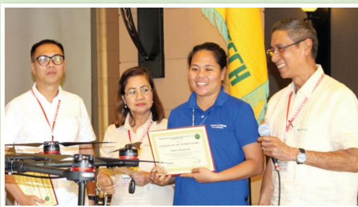
Representative from Sagrex Corporation receives the plaque of appreciation as one of the sponsors.