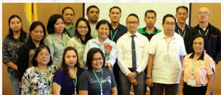
Group photo with participants from CACI, AALCPI Planters and First Farmers