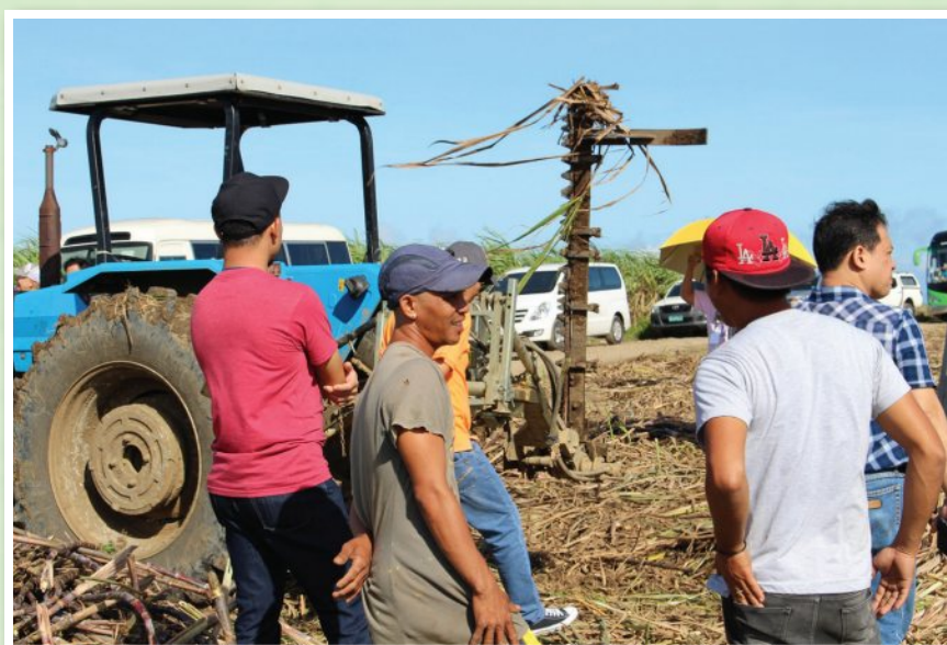
Participants inspect the tractor mounted with Sicklesword Cutter.