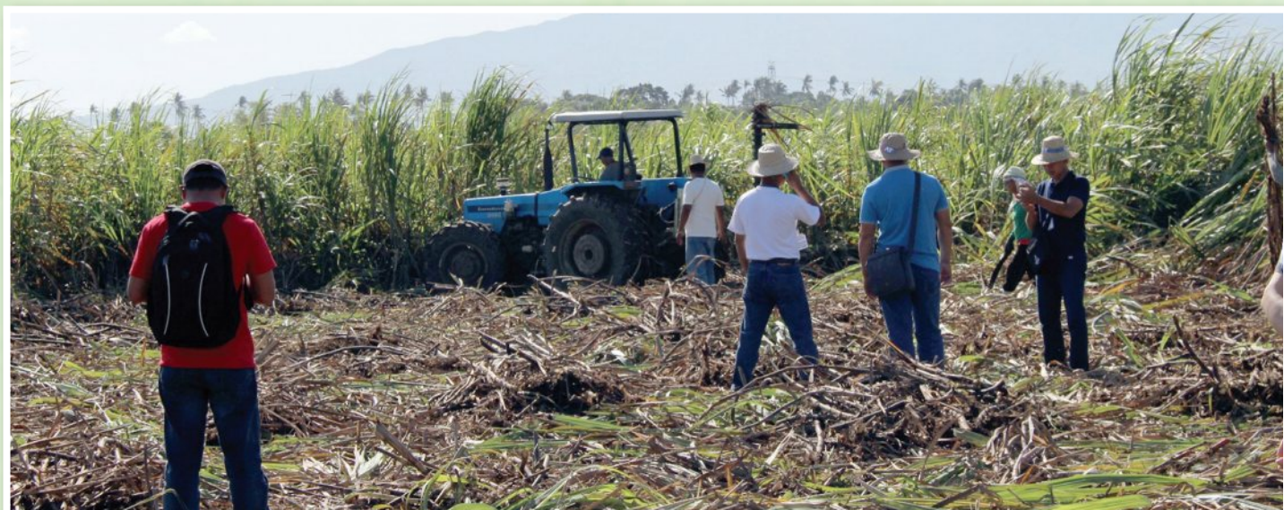
Farm tour participants witness the actual demonstration of farm implements and equipment which can be utilized for farm mechanization, including the use of a drone for fertilization, at Hda. Bilbao, Brgy. Punta Mesa, Manapla.