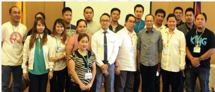
Group photo with URC Sugar Division Group