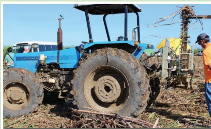
Tractor mounted with Sicklesword Cutter