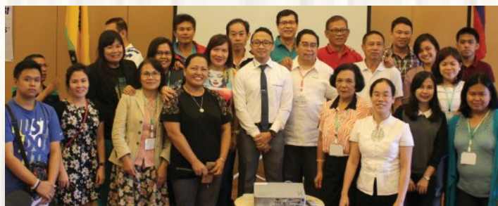
Group photo with SRA participants