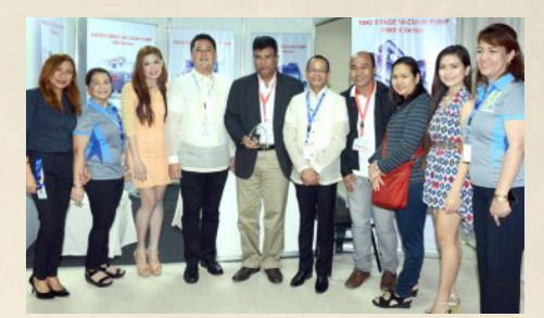
PPI PUMPS PVT LTD.