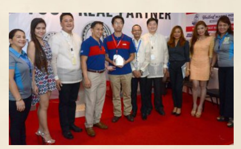
NSK INTERNATIONAL (SINGAPORE) PTE LTD