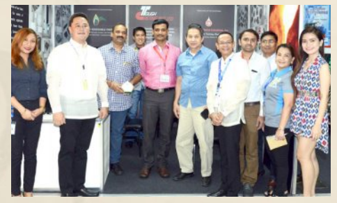
TOUGH CASTING PVT. LTD