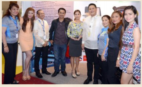
ALPS MAINTAINEERING SERVICES INC.