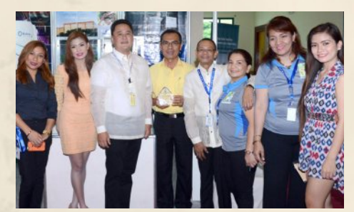
NCH PHILIPPINES, INC.