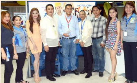
MOTOLOGY ELECTRIC PTE LTD