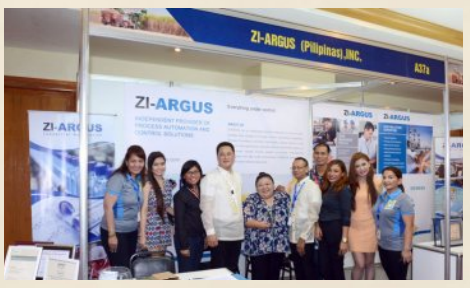
ZI-ARGUS (PILIPINAS), INC.