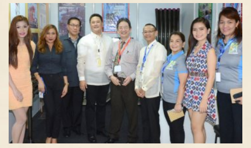
ENERTECH SYSTEMS INDUSTRIES, INC.