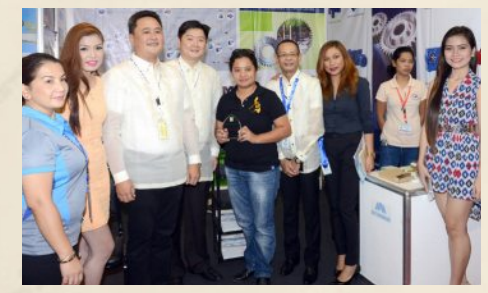
ISHAN INTERNATIONAL PVT. LTD.