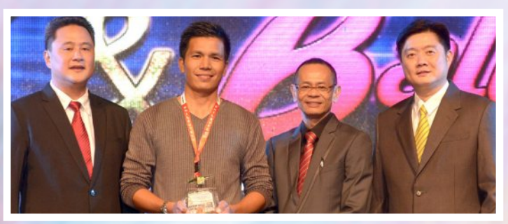
Golden Great Asia-Pacific Dragon Corp Bronze Sponsor