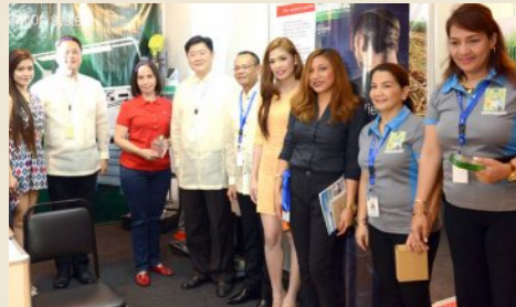
UNIWELL TECHNOLOGIES CORP.