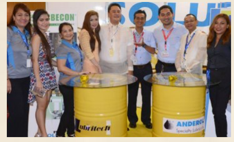
FLUID SOLUTIONS, INC