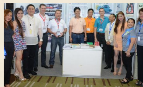
ENGINEERED SOLUTIONS INTERNATIONAL CORP