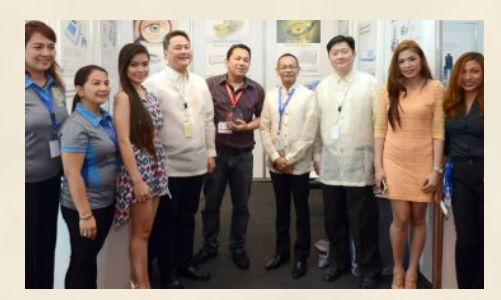
JAN DALE ENTERPRISES CORPORATION