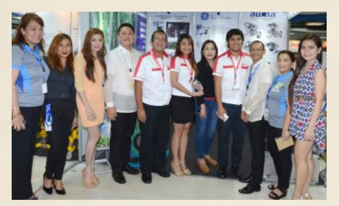
FLOWTORK TECHNOLOGIES CORPORA-TION