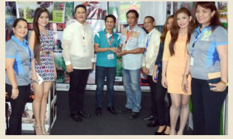
KUBOTA PHILIPPINES, INC.