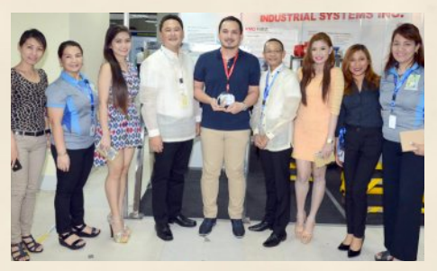
G. MAGNETICS INDUSTRIAL SYSTEMS INC.