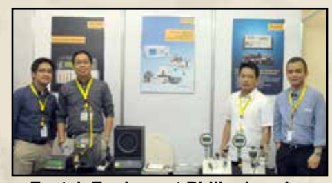
Esetek Equipment Philippines Inc