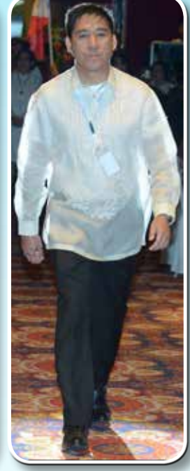
VP & Dir. (Factory Eng'g Division)