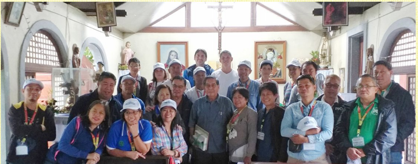
The Valmayor Family's private chapel served as lecture room for the participants.