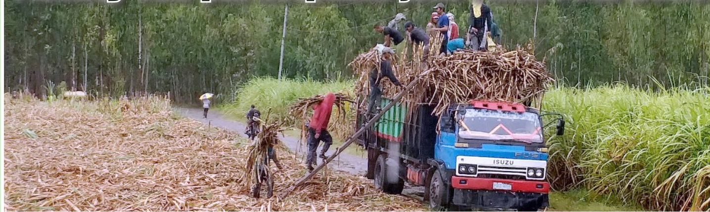
Farm workers load sugarcane at Belmayor Farms, San Carlos City.

Twenty-one participants joined this year's edition of the Philsutech Farm Tour in San Carlos City, Negros Occidental last February 6.