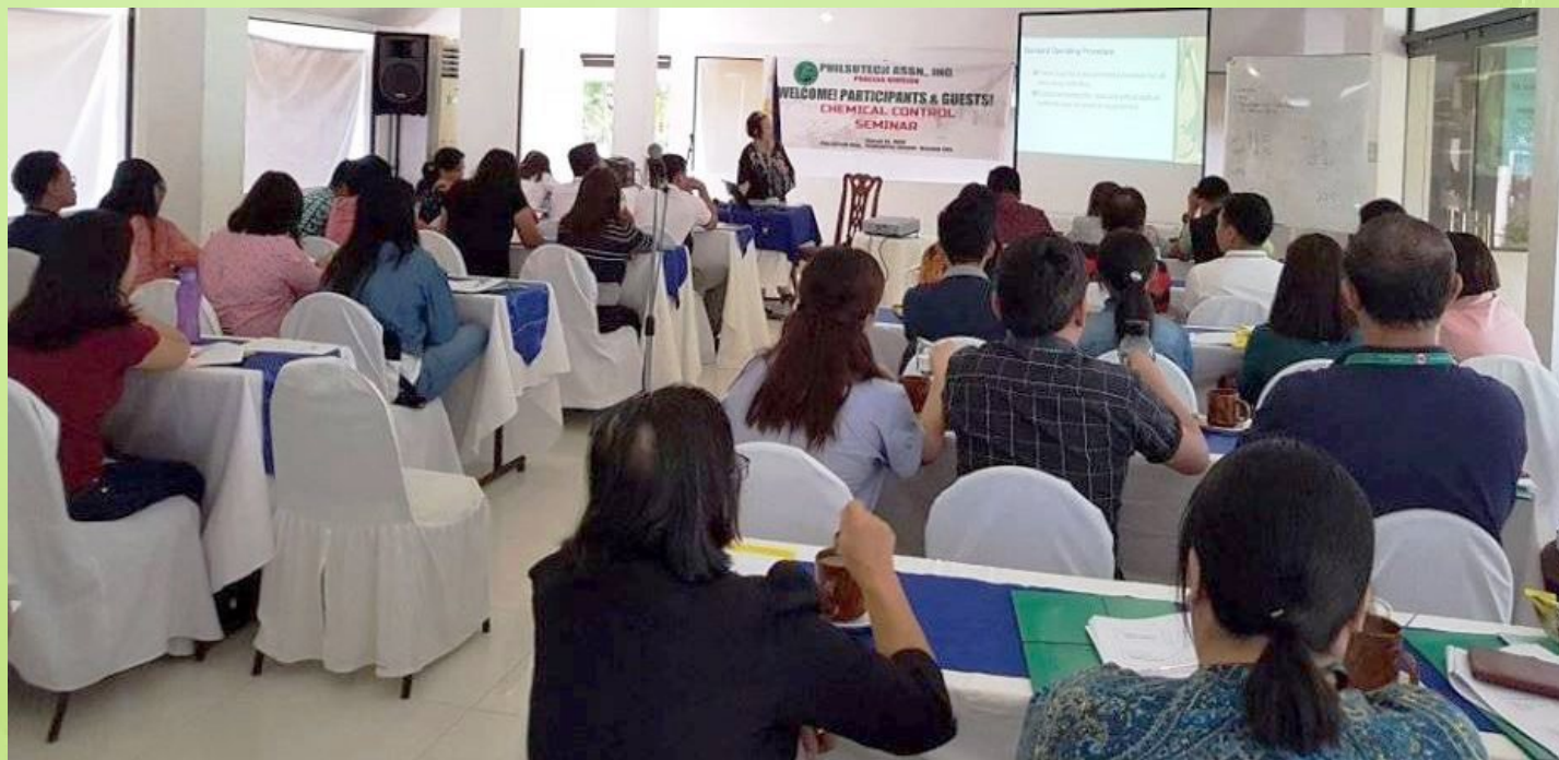
Forty participants joined the Chemical Control Seminar conducted last March 13 at Luxur Place, Bacolod City.

Forty participants finished the Chemical Control Seminar conducted last March 13 at Luxur Place, Bacolod City.