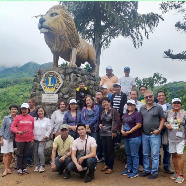
On the way back to Bacolod, the group stopped for a sight-seeing tour at the Lion's Viewing Deck in Don Salvador Benedicto.